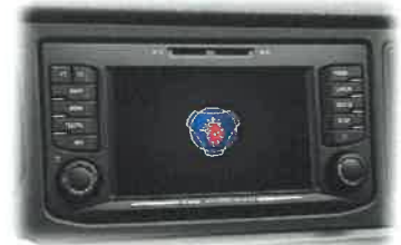
Scania Infotainment Premium

Interface to connect up to 2 pcs MXN camera (with or without motorized shutter) at Scania Infotainment Premium monitor (AUS4).