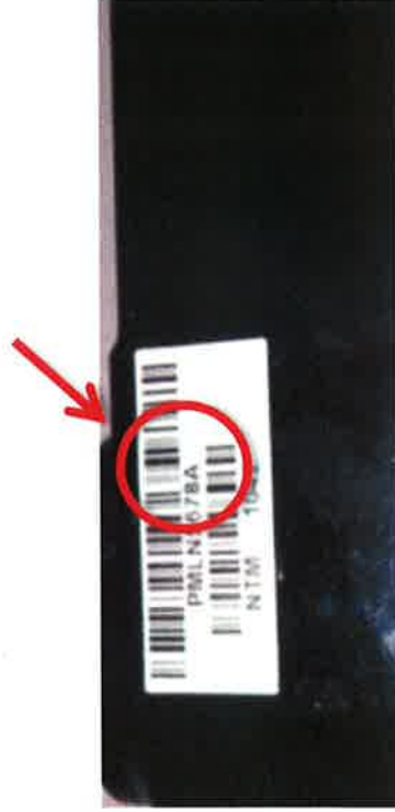
Label indicates revision of Control Head